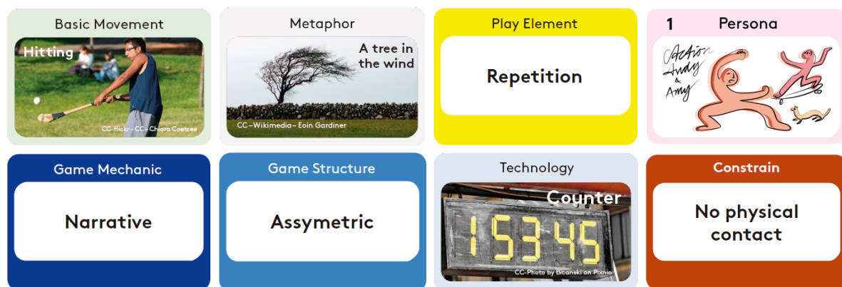
Figure 3. Sample modifier cards (8 out of 284) belonging to 8 different categories (among 16 available).

This third study was motivated by the takeaways from study 2 regarding lack of previous preparation. The experimental setup was modified to address this issue, adding two previous meetings where two facilitators (who already participated in study 2) had the chance to use materials in the MeCaMInD toolbox to discuss and design the composition of the experimental session. The materials used were the four method cards used in study 2 (Figure 2), plus the complete set of modifier cards available in the toolbox (Figure 3). Having in mind their knowledge about the four game-based experiences and the cards, the facilitators first filtered out the modifiers that didn't suit the game-based mood-setters, to then design a session with only two of the available games (Copy Dance and Johann Sebastian Joust), and two sets of modifiers tailored to each of them. They planned to have the session as part of a master course, as a training session for one of the course projects.